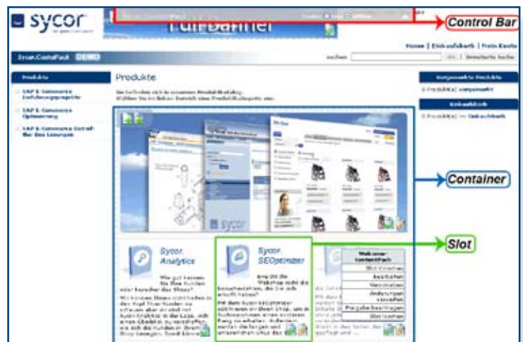
Structure of the Sycor.ContentPack